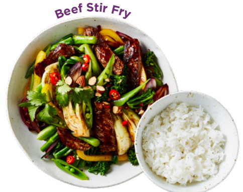
¾ cup rice = 3 portions