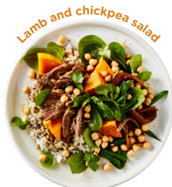
½ cup rice + ¾ cup chickpeas = 3 portions