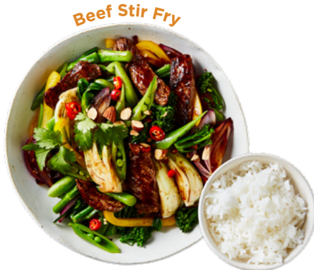
½ cup rice = 2 portions