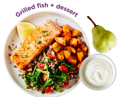
¼ medium sweet potato + ½ cup cooked quinoa + 1 piece fruit + ½ cup yoghurt = 4 portions