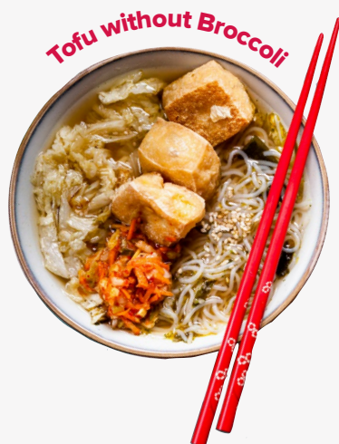
Tofu without Broccoli