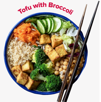
Tofu with Broccoli